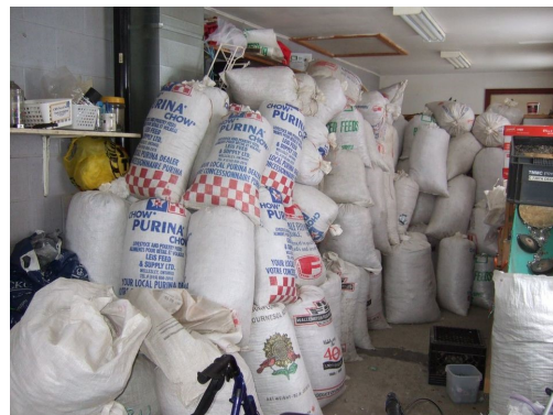
Bags filled with pop can tabs at the Royal Canadian Legion in Elora.