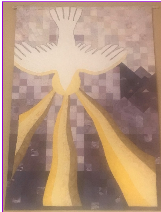
Be sure to view this beautiful quilt in the sanctuary.