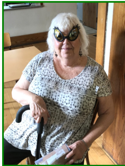
Trillium's Annual Garage Sale - A Fabulous Success So many fun photos and details about it inside this newsletter.